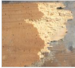
Anobium damaged floor board