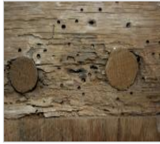
Death watch beetle emergence holes