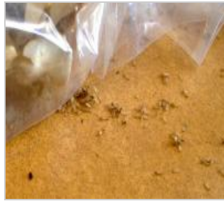
Trogloderma cast skins