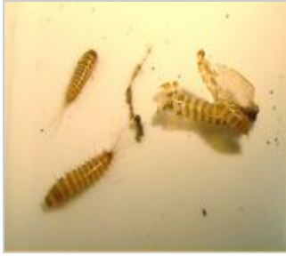
Trogloderma angustum larvae and cast skin