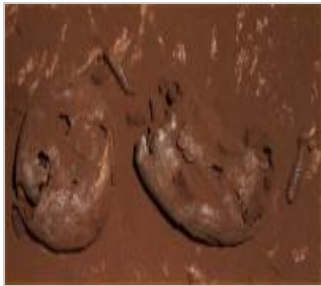
Trogloderma larva attacking slime mould specimen