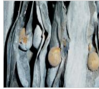
Trogloderma cast skins on dried peas in an art installation