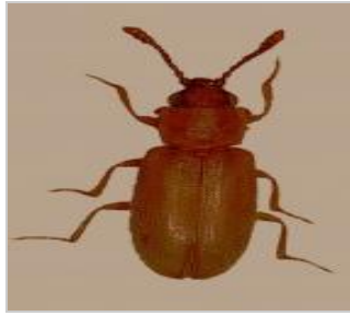
Fungus beetle Cryptophagus acutangulus