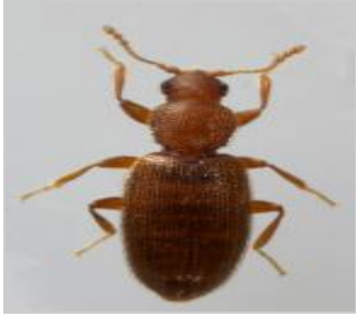
Fungus beetle Corticaria sp