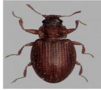
Plaster beetle Enicmus fungicola