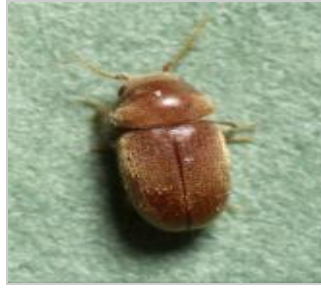
Cigarette beetle Lasioderma serricorne