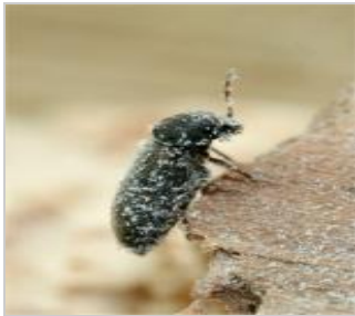
Woodworm / Furniture beetle Anobium punctatum