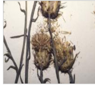
Herbarium specimen damaged by biscuit beetle