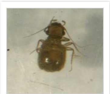
Black booklouse Lepinotus