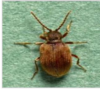
Australian spider beetle Ptinus tectus