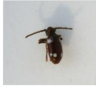
Six spot spider beetle Ptinus sexpunctatus