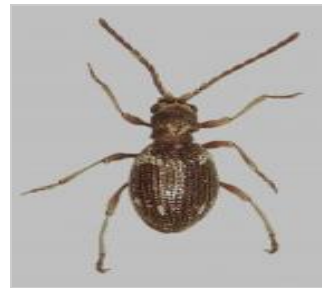
White marked spider beetle Ptinus fur