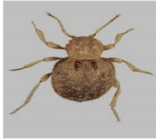
Globular spider beetle Trigonogenius globulus