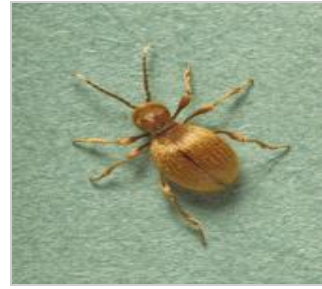
Golden spider beetle Niptus hololeucus