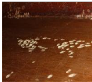
Spider beetle damage to shelf