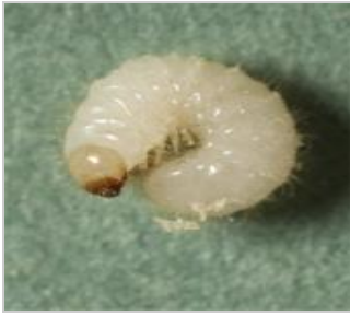
Australian spider beetle larva Ptinus tectus