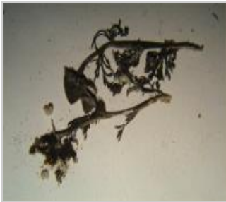
Herbarium specimen damaged by spider beetle