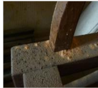
Anobium frass piles