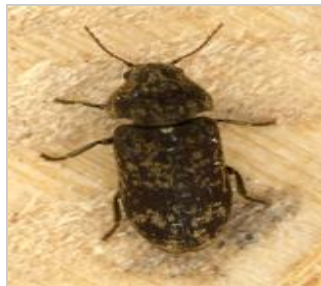
Death watch beetle Xestobium rufovillosum