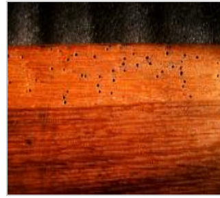
Anobium emergence holes from sapwood