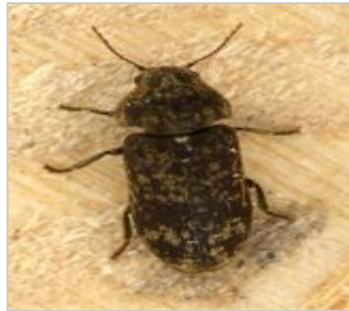
Death watch beetle Xestobium rufovillosum