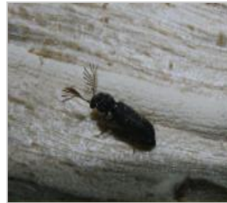
Fan bearing wood borer Ptilinus pectinicornis