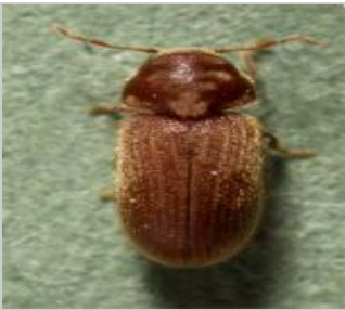
Biscuit beetle Stegobium paniceum