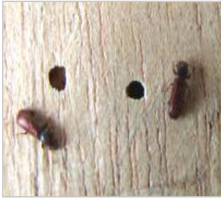
Powder post beetle and emergence holes