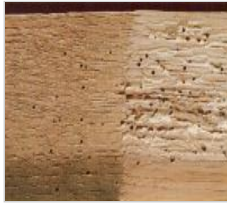
Powder post beetle damage