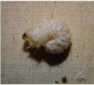
Death watch beetle larva Xestobium rufovillosum