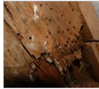
Death watch damage to roof beam