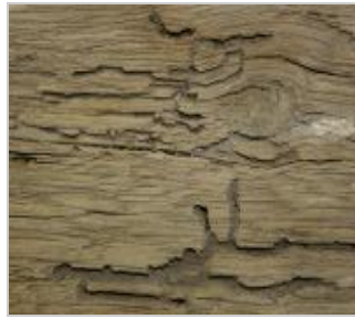
Death watch beetle tunnels