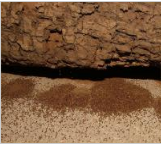
Death watch beetle damage and frass