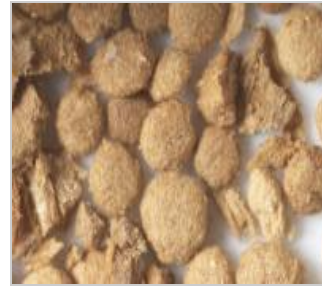
Death watch beetle frass