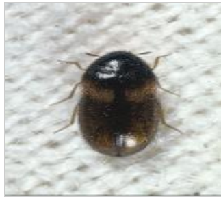
Museum nuisance beetle Reesa vespulae