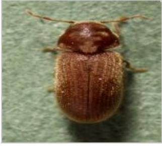
Biscuit beetle Stegobium paniceum