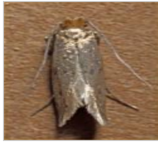
Case-bearing clothes moth Tinea pellionella