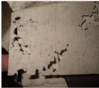
Silverfish damage to paper