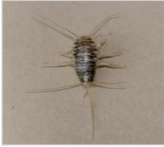
Firebrat Thermobia domestica