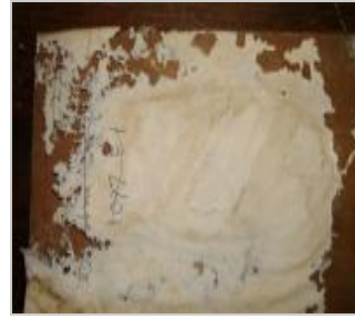
Silverfish damage inside book