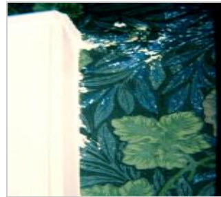
Wallpaper damaged by silverfish