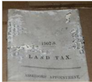
Silverfish grazing damage