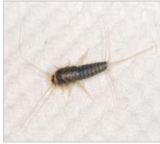
Grey silverfish Ctenolepisma longicaudatum