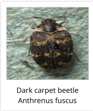
Dark carpet beetle Anthrenus fuscus