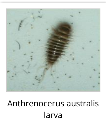
Anthrenocerus australis larva