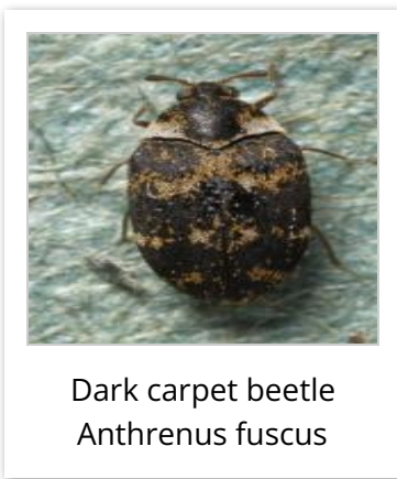
Dark carpet beetle Anthrenus fuscus