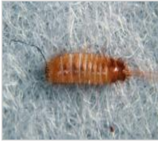
Museum nuisance larva Reesa vespulae