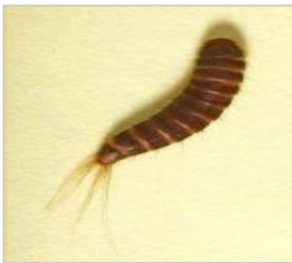
Two spot carpet beetle Attagenus pelli larva