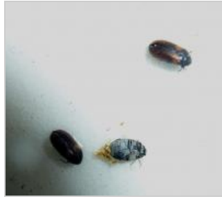
Reesa and Anthrenus adults on trap