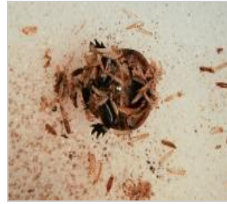
Reesa infestation in beetle collection