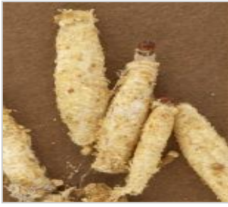
Case bearing clothes moth larvae and cases