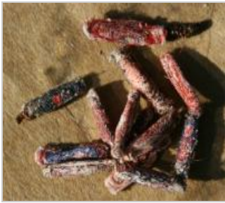
Case-bearing clothes moth cases Tinea pellionella